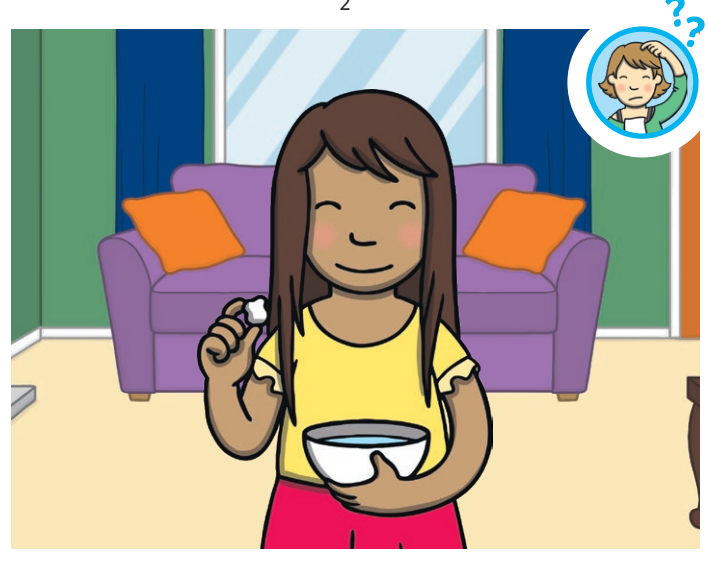
Q1: What do you think Grandpa Dada mean by 'You're like Florence Nightingale'?