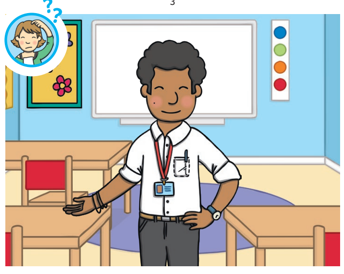
Q1: What was Robin struggling with?