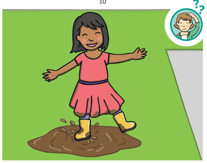
Q6: What do you think might happen next?