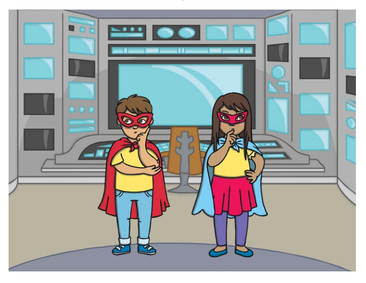
Q3: What did the message tell Kit and Sam?