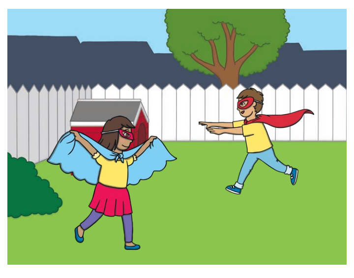
Q1: What were Kit and Sam playing?

Q2: Where did Kit and Sam ask the magic map to take them?